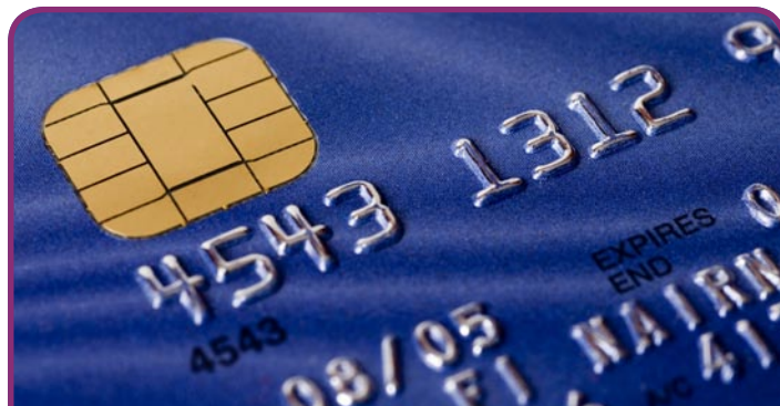
Borrowing should be on the best terms available to you

Every so often, you may receive a letter from your bank offering you the opportunity to switch debt from 'expensive store cards' to your usual credit card with them. But is this always a good idea?