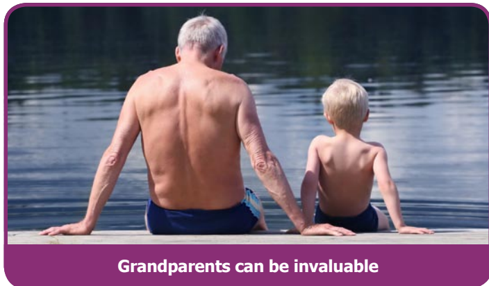
Grandparents can be invaluable

Grandparents are becoming one of the most important parts of the modern family, according to recent research.