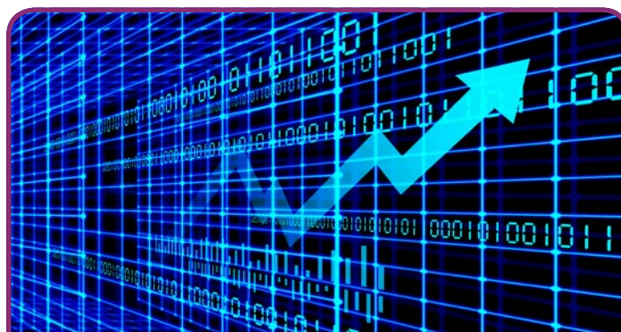
An attractive potential return

While some people wish to retire as soon as possible, others feel that they will be able to work well beyond even the increased state retirement age (which will reach 66 for both men and women by April 2020). Between April 2034 and April 2036, the state retirement age increases to 67, affecting anyone currently