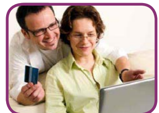
Back Page briefing: Beware online banking