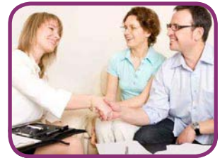
Active vs. passive investing