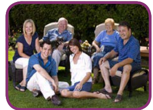
Who needs a will? (revised rules from 2009)